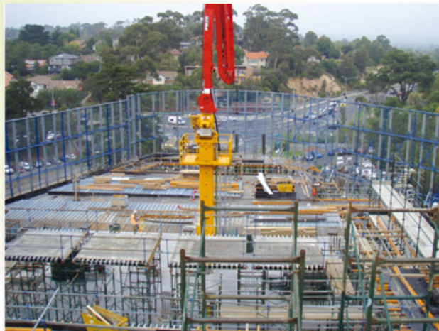
Formwork being erected for Level 5