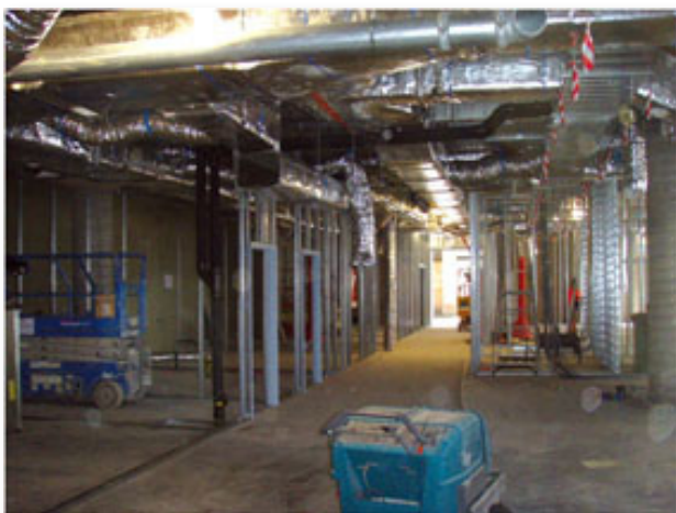
Wall framing and services being installed on Level 3

Thanks to our wonderful supporters, we continue to make steady progress.