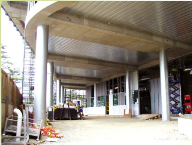
Main drop off area on Level 2 with glazed facade being installed